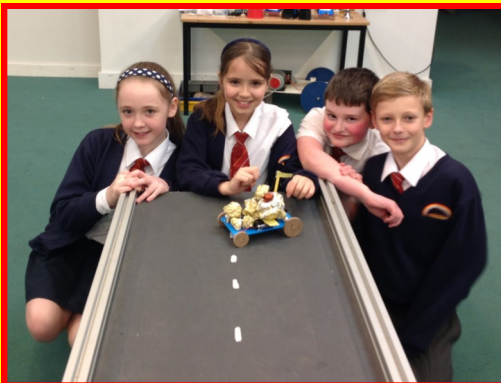
Team "TaterRacer" proudly showing off their winning design. The fastest buggy of the day was Team "Cupcake Racer".