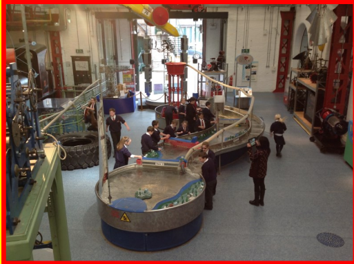
Year 5 and 6 visited Enginuity in Telford on Monday & Tuesday for a school trip.